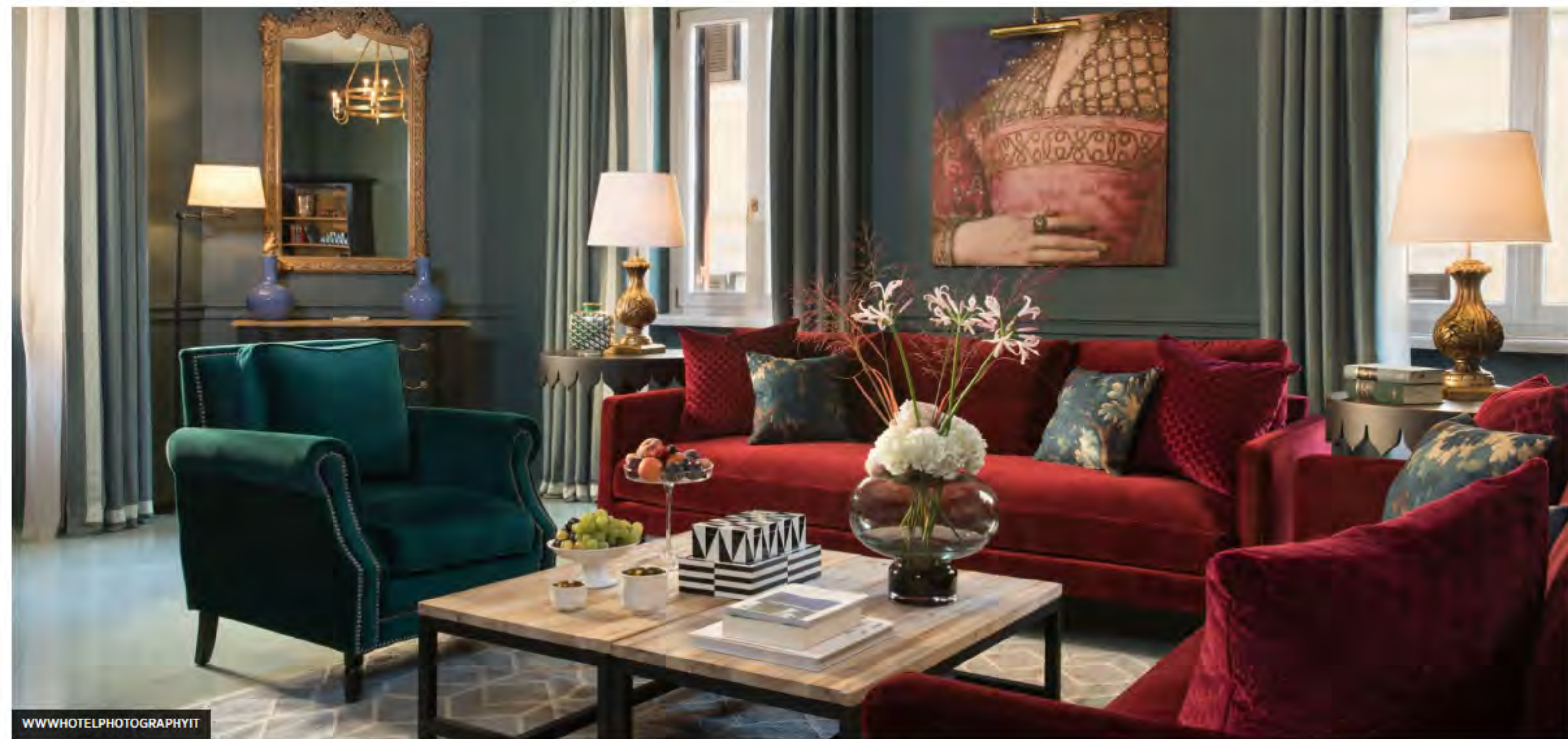
BORGHESE SUITE AT ROCCO FORTE HOUSE