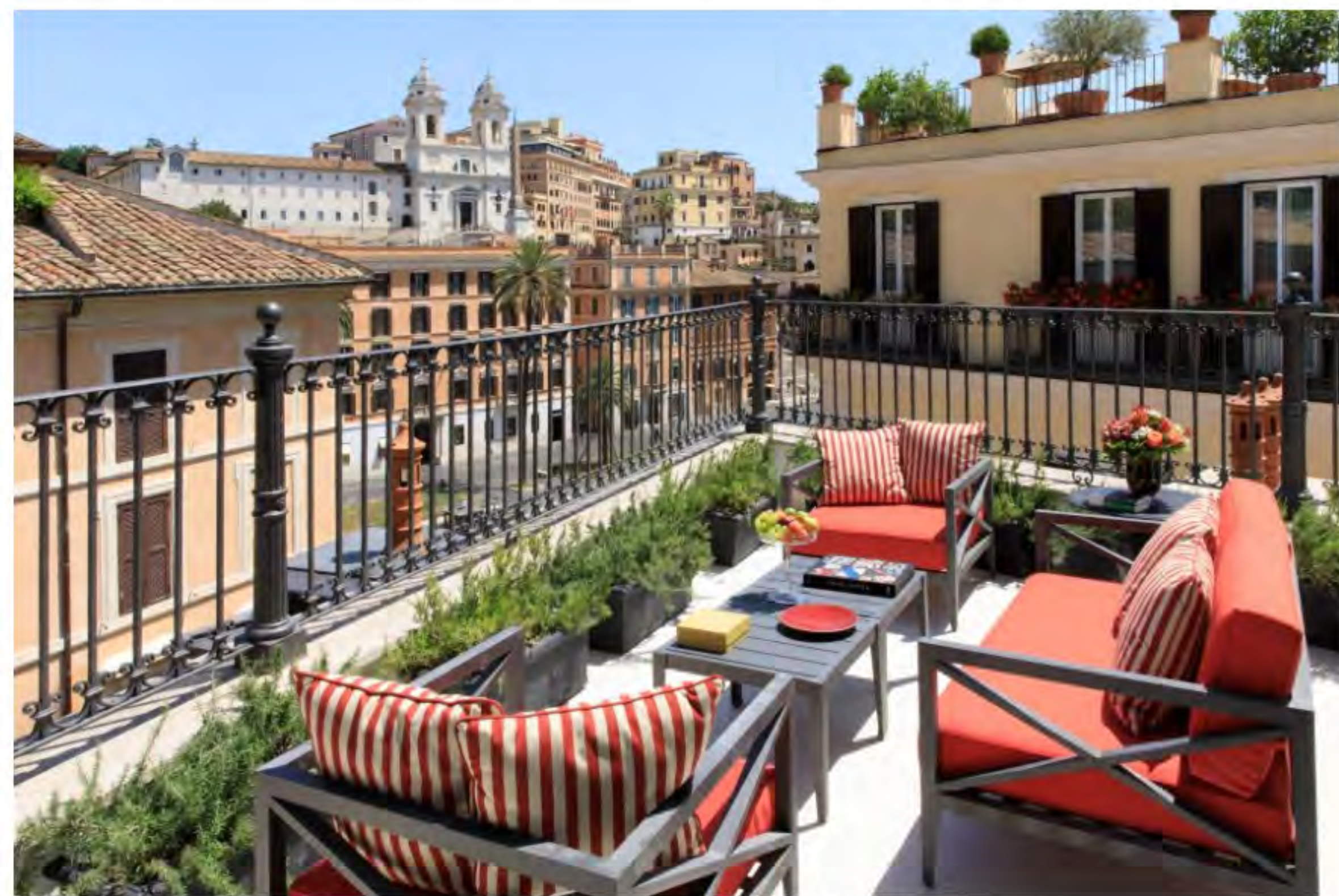
A TERRACE WITH VIEWS OF ROME

TRAVEL NEWS 22 of the world's most amazing travel facts